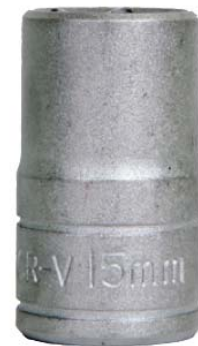
Item no. 9996920