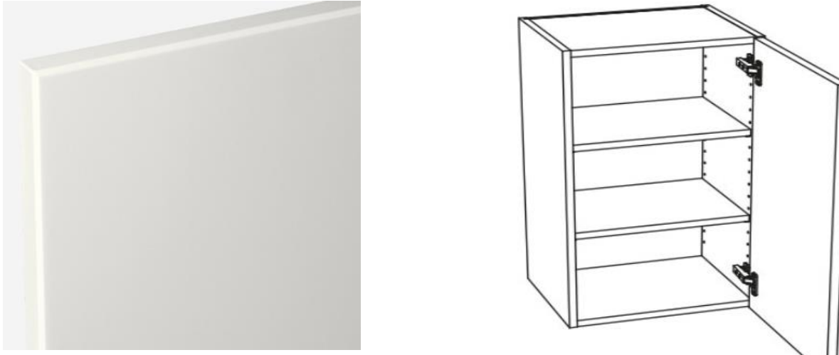
Figure 1, shows a picture of the plain and painted MDF kitchen door Bistro White and its application in a kitchen cabinet.

The hinges and cabinet are not part of the EPD system boundary.